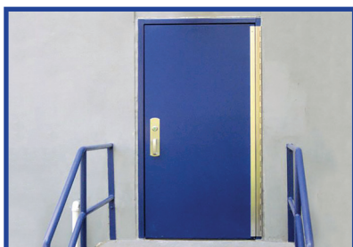
Pedestrian Flood Door (PD-520)