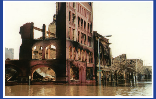
Grand Forks, North Dakota, 1997