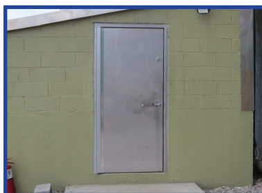
Mechanical Room Flood Door (PD-525)